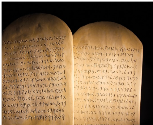
"Alive in Christ, Serving God, Empowered by the Spirit" 2

The reformer and theologian Martin Luther (this year marks the 500th anniversary of the beginning of the Protestant Reformation)