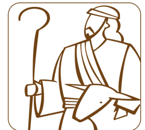
My sheep hear my voice. John 10:27

Some traditions observe this day as Good Shepherd Sunday, Psalm 23 has direct thematic connections with that observance. John 10:22-30 is set in an entire chapter that explores Jesus as the Good Shepherd. Consider Tabitha's story. In what ways might her ministry provide another perspective into this observance and our own identity as those who "shepherd" the way of Christ?