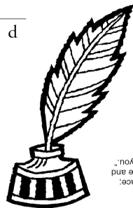
Answer: "Agree with one another, live in peace and the God of love and peace will be with you."