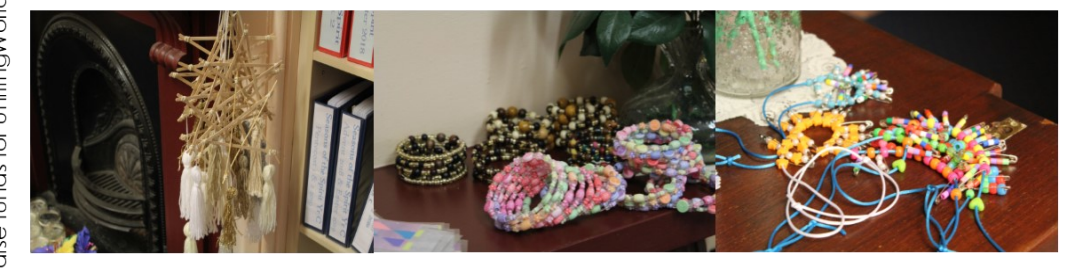
A hanging for the doorway