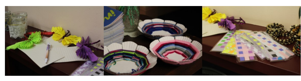
A notebook by the phone