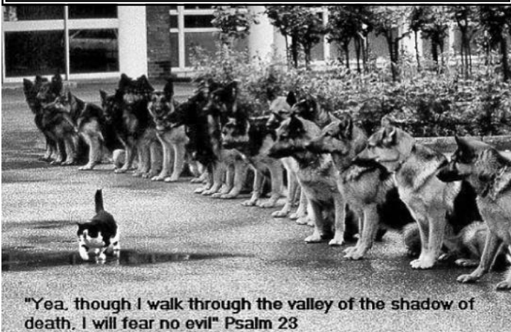
“Yea, though I walk through the valley of the shadow of death, I will fear no evil” Psalm 23