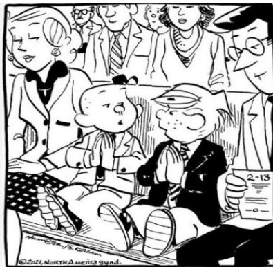
"WHAT DOES AMEN MEAN?" "IT MEANS OVER AND OUT."