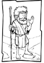
JOHN THE BAPTIST