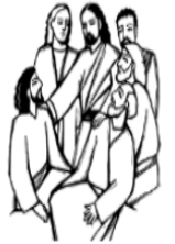
Calling the Twelve to him, he sent them out two by two. Mark 6:7 (NIV)