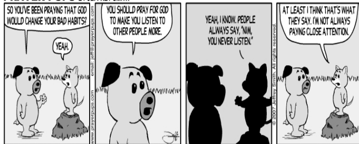
YOU CAN LEARN A LOT MORE ABOUT GOD AND ABOUT YOURSELF IF YOU LISTEN TO OTHERS. www.PrayerPups.com

One reason people resist change is because they focus on what they have to give up, instead of what they have to gain.