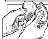
I am the Bread of Life.

35 Then Jesus declared, “I am the bread of life. Whoever comes to me will never go hungry, and whoever believes in me will never be thirsty.”