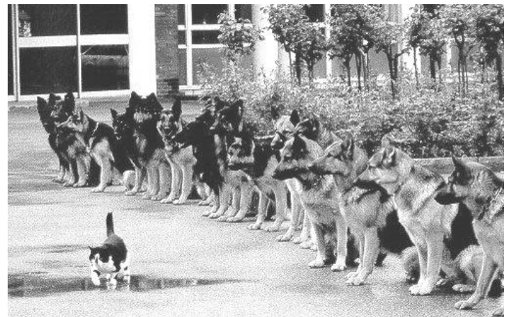
"Yea, though I walk through the valley of the shadow of death, I will fear no evil" Psalm 23

6 Surely goodness and mercy shall follow me all the days of my life: and I will dwell in the house of the LORD for ever.