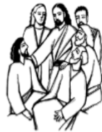
Calling the Twelve to him, he sent them out two by two. Mark 6:7 (NIV)